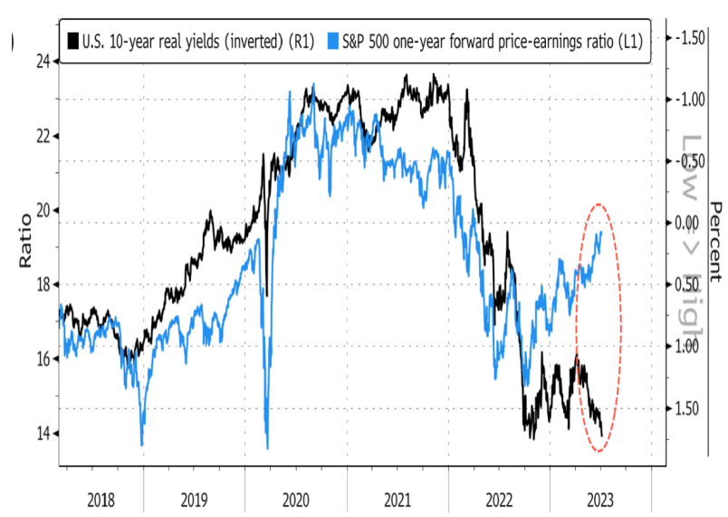
(Chart 3)

positions, which we feel provide better risk/reward dynamics. Ultimately, we believe risk management is the most important factor to wealth accumulation and preservation. We build portfolios with the objective of minimizing downside capture. After an incredible rally to start the year, we believe it's prudent to begin to underweight risk assets in our portfolios. We will continue to monitor our portfolios as the facts change and will remain tactical as the situation evolves.